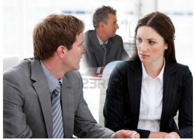
Fig.1. Is this image an authentic one? An example spliced image involving multiple human faces.

Images are popular means of communication and many people rely on them, so it is necessary that their authenticity should be proved. As the field of image processing and its applications has grown and extended to large area, there is an increase in the availability of image editing software also. Due to the easy availability of digital editing tools, alteration, and manipulation became very easy and as a result forgery detection becomes a complex and threatening problem. Because of this, a large number of doctored or edited images are circulating in our media of communication. This can deceive the viewer, and forces him to accept or agree on the contents of the image.