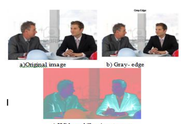
c) IIC based illuminant map Fig.2 Example illuminant maps for a original image – Gray edge and IIC based illuminant estimates.

In image forensic analysis, the investigators make use of all known evidences of tampering detection like shadows, reflection, replicated blocks, steganalysis etc. In the viewpoint of image manipulator, it is very tedious or nearly impossible to alter the illuminant conditions of individual photographs that are taken to create a composite image. So illuminanat estimation can be used as a forensic tool [2].